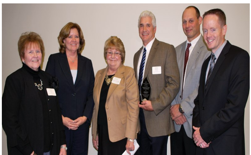
Receiving the AAA Award at the "2013 Excellence in Education" luncheon.